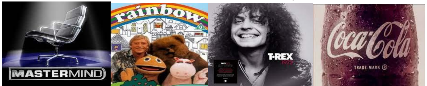
Castlebank Photo Album

The year from the last edition was 1993!