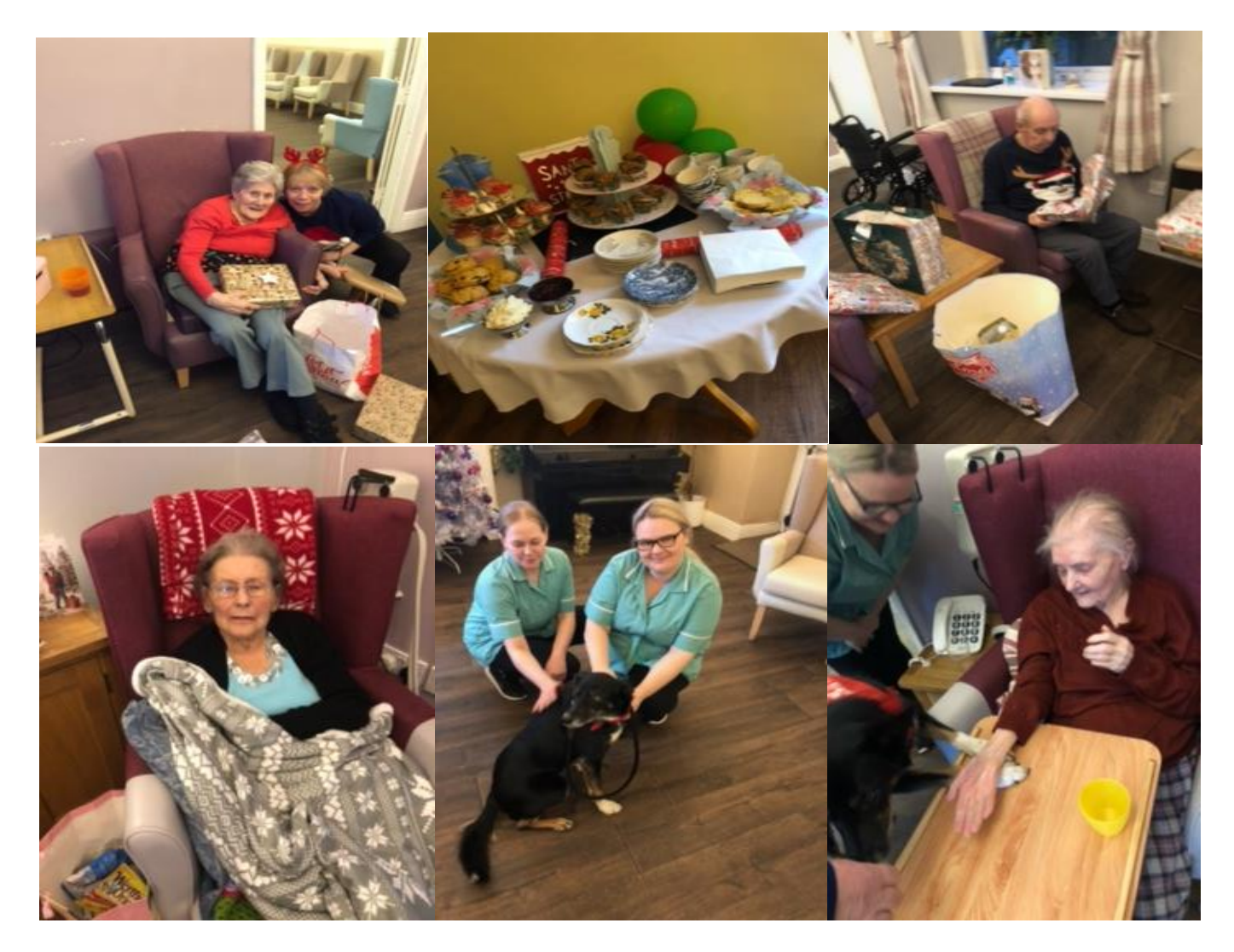
residents. January 2023

Over the past month Castlebank has been a warm hub of happiness, celebration and enjoyment and here are some of the photos that capture and reflect on some of these moments and celebrate our wonderful