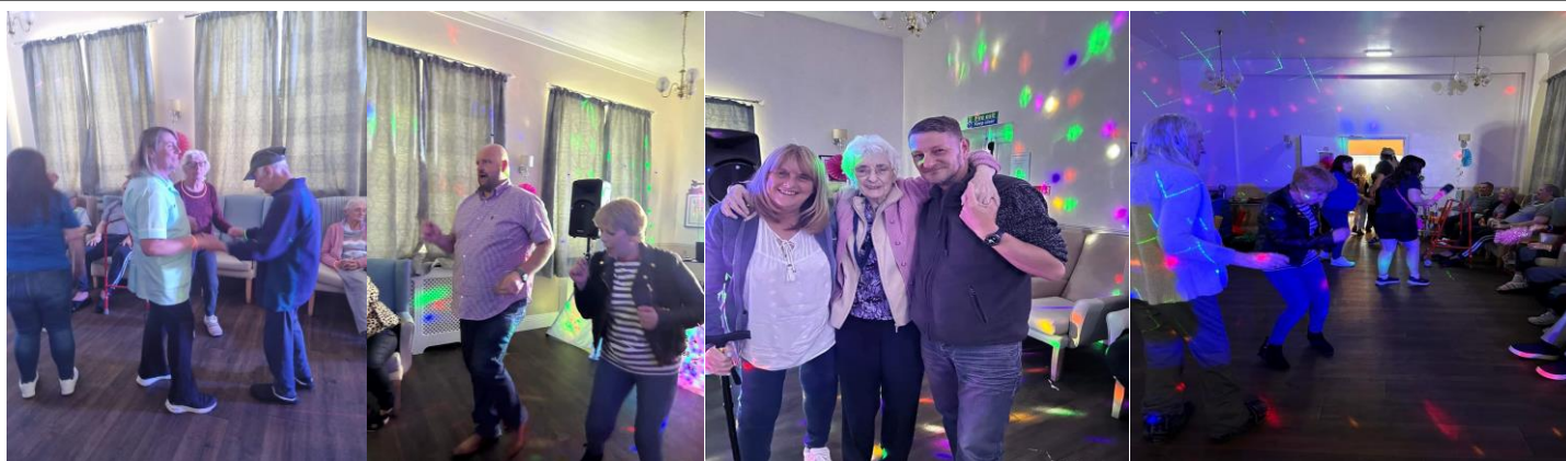
"I wanna dance with somebody!" at our recent 80s party evening!