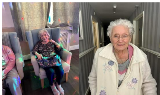
Ladies at leisure enjoying some relaxation.