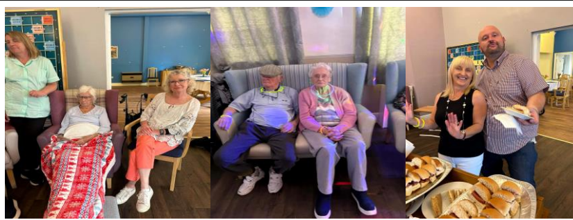
Activities galore party food!